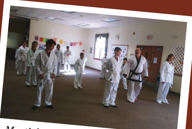
Martial Arts Class 2023